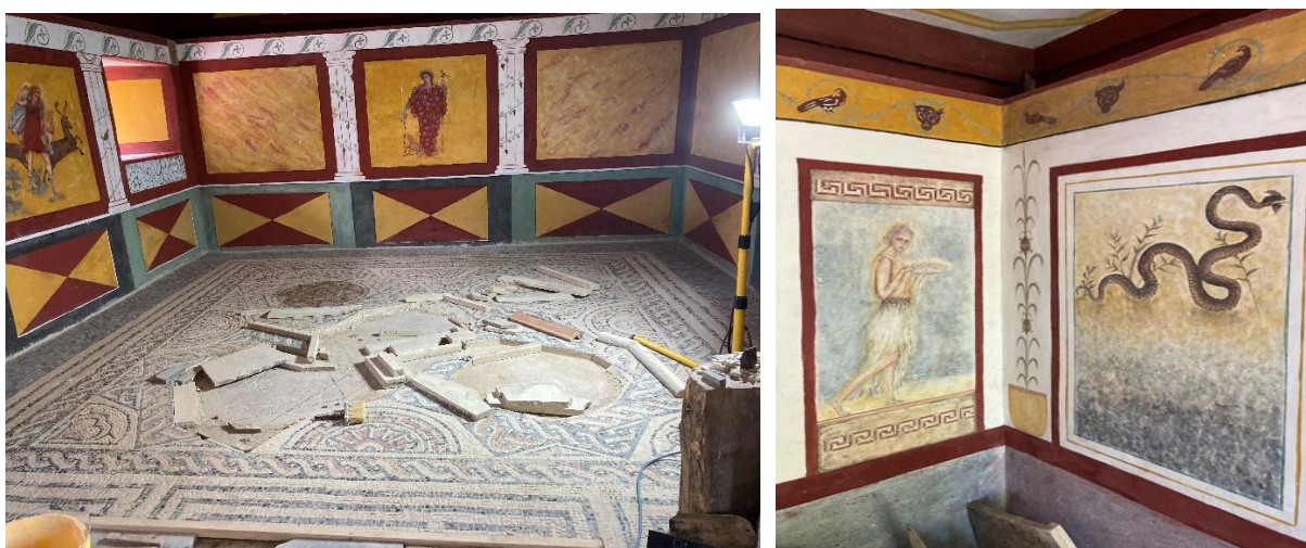
The Roman dining room showing the mosaic floor and frescoes