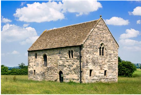
Meare Fish House