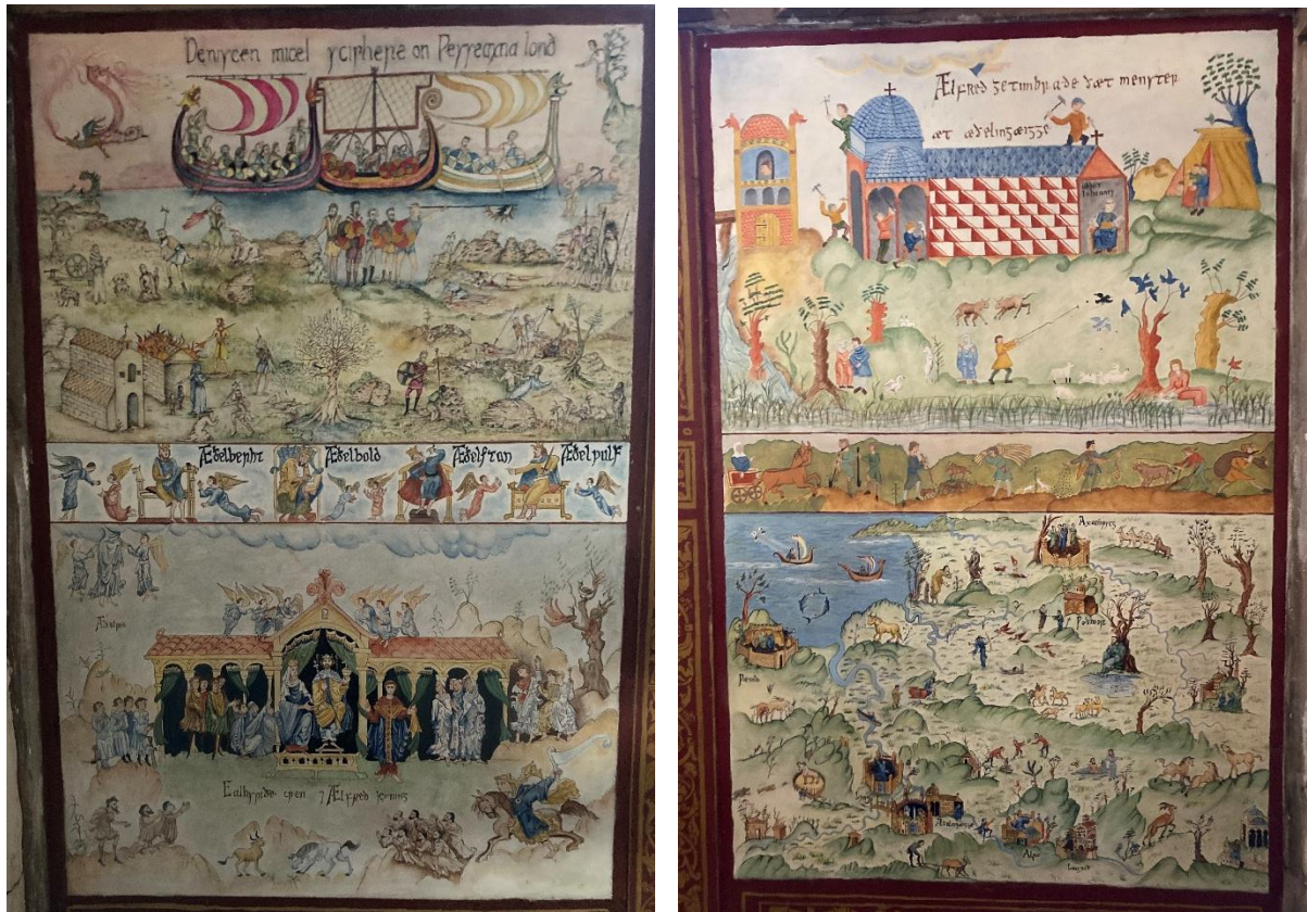
Two murals in the Anglo Saxon Long Hall with tales of Alfred and the Vikings